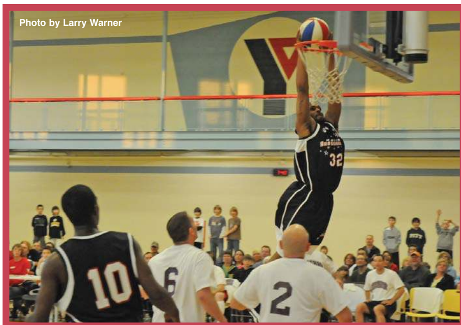
A Rotary fundraiser with the Harlem Ambassadors at Rose E. Schneider YMCA. The proceeds benefited a school in Patzun, Guatemala.